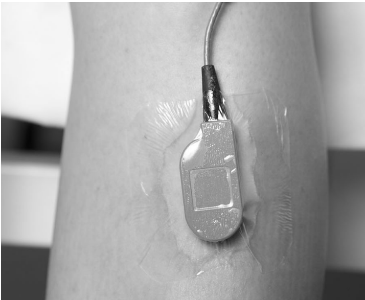
Figure 3. EMG surface sensor

Fine wire sensors — Hair-sized sensor wires, placed in your muscles using a small needle, provide information about the muscles far below the skin. You may feel brief discomfort, similar to receiving an injection, when the needle is inserted.