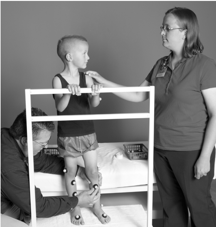
Figure 2. Attaching the reflective markers

The therapist attaches special reflective markers that are used to collect information during the motion analysis test (Figure 2). The markers are taped to specific places on your child's body. The markers look like small balls attached to a small, round base. The therapist uses double-sided tape to attach them. It does not hurt to attach them. These markers are recorded by special computerized cameras positioned around the lab.