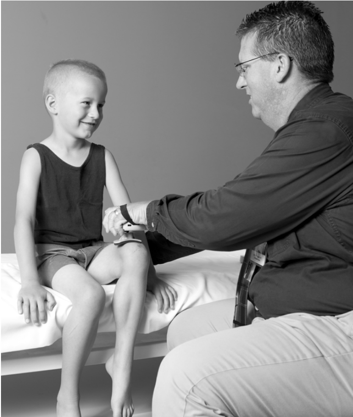
Figure 1. Getting a physical exam

A typical visit begins with a physical examination. A physical therapist and kinesiologist work together to assess your child's flexibility, strength and muscle spasticity or stiffness.