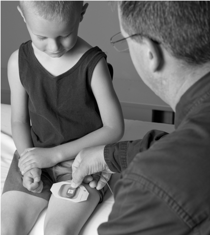
Figure 3. An EMG surface sensor is taped over a muscle. Most kids only need surface sensors. If your child's care team needs to collect information about muscles far below the skin, they may use a fine wire sensor. This is a hair-sized wire, placed in the muscle using a small needle. Your child may feel a brief moment of discomfort, similar to receiving an injection, when the needle is inserted.

During the test, additional sensors may be taped to your child's muscles to detect when the muscles are active. This is called electromyography (EMG). EMG records the timing of muscle activity occurring while moving. Information collected shows when the muscles are working and the timing of the muscle activity during movement. These sensors connect to a special backpack that collects the information.